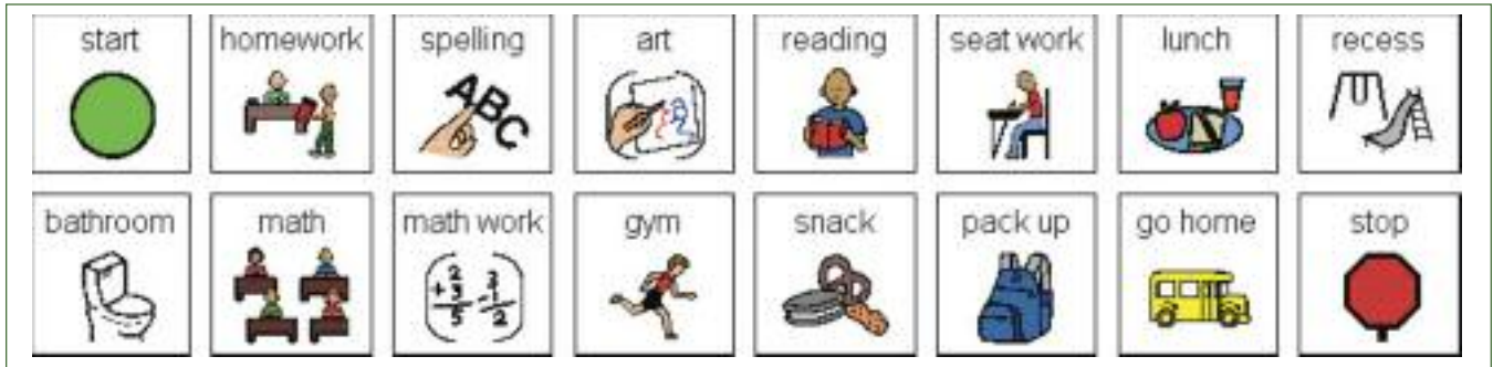
Figure 1. Example of Between-Activity Schedule

Note. Picture Communication Symbols © 1981–2008 by Mayer-Johnson LLC. All rights reserved worldwide. Used with permission. Boardmaker® is a registered trademark of Mayer-Johnson LLC.